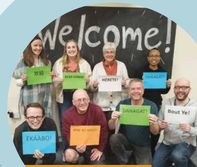
From Rio to Beijing and Mumbai, We Welcome You!

I particularly remember one student from Vietnam who took part in a Hope Explored course and then followed by reading John's Gospel. This person had never heard of Jesus, yet now continues to explore His Word. At Christmas we had a visiting speaker sharing the true meaning of Christmas at the Global Café. Just before he was due to speak a crowd